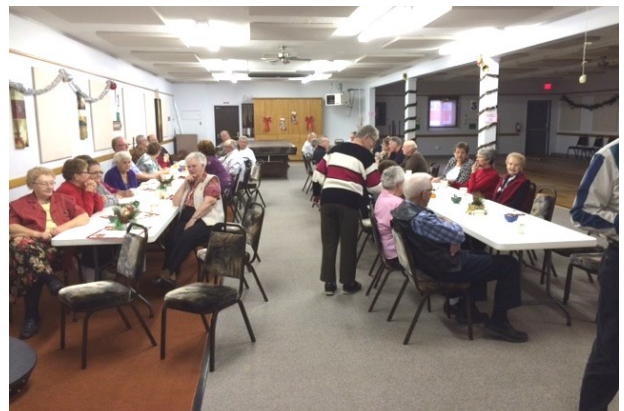
I enjoyed visiting seniors in Daysland while joining them for their Christmas celebration.