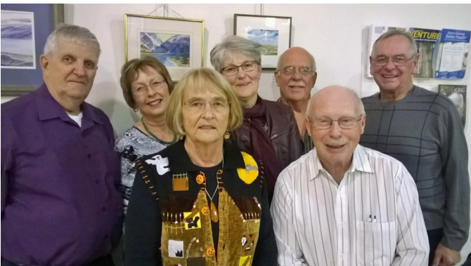
The Medicine Hat Senior Citizen's Advisory Committee at the public meeting